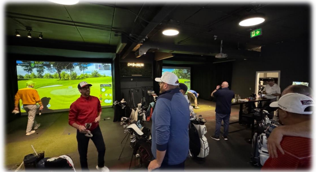
Our busiest simulator season ever – Saturday Night League in full swing.